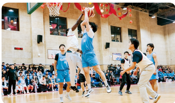
A friendly basketball match at Suzhou North America High School

Along the zigzagging corridors of Zhuozheng Garden, they explored the mysteries of lattice windows and decorated openwork windows, experiencing the ultimate Oriental aesthetics. The Cold Spring Harbor Asia DNA Learning Center became a scientific focus: the Chinese and American students collaborated to complete DNA biological exploration experiments and decode DNA.