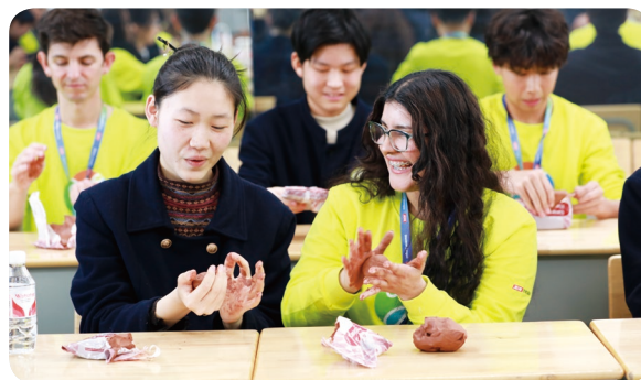
Making "clay dogs" at Jingjiang Senior High School, Jiangsu Province

At Jiangsu Jingjiang Senior High School, the U.S. teachers and students tried their hand at crafting Taizhou's iconic "clay dog" zodiac figurines, molding cute animal shapes with pottery clay. During the Qingming Festival (Tomb-Sweeping Day), the Chinese and American students collaborated in making jade-hued qingtuan (glutinous rice dumplings). The cultural tour spotlighted nature-craft fusion: Against the backdrop of rapeseed terraces where 10,000 mu of golden blossoms were intertwined with canals to form a tapestry of living art on Earth while the visitors fashioned rapeseed-flower kites made with colored paper on a bamboo frame.