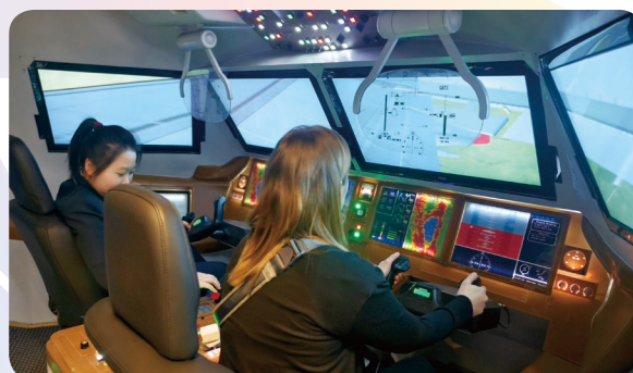
Simulated aircraft piloting at Huaiyin High School

During their visit to Huaiyin High School, the American students simulated aircraft piloting at the aerospace course base and sang You Raise Me Up together with their counterparts at the school's symphony orchestra. When touring the Canal Museum, the visitors witnessed the spectacle of "Granary of the Empire" through holographic projections. In Hexia Ancient Town, they learned to make chasān (fried noodles) and soup dumplings with crab roe before tasting the food of their own making, which helped them understand the craftsmanship behind the "state banquet standard" of Huaiyang cuisine through the complex processes from dough rolling to soup filling.