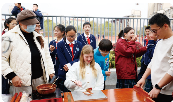
Sugar painting-making at Jiangnan School

The "Seven Aspects of Jiangnan" thematic activities at Jiangnan School became the highlights: from sugar figure-making to Hanfu photo-taking, from drone programming to a FIBA 3x3 basketball game, from study room experience to lacquer fan-making, and finally, dumplings made by themselves to round off the school visit. When visiting Pearl S. Buck's