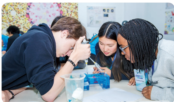
Decoding DNA at Asia DNA Learning Center, Cold Spring Harbor