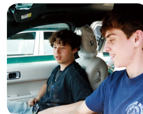
Visiting Li Auto's smart manufacturing base