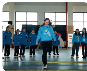
Experiencing bamboo pole dance at Qishuyan Senior High School

At Qishuyan Senior High School, the American teachers and students participated in pot-throwing, hoop-rolling, and bamboo pole dance, igniting a craze for traditional games. In Changzhou University, a lecture on the theme of "Studying in Jiangsu" ignited their interest for studying in China. The city's cultural visits focused on people's daily life: in Hongmei Park, the morning Tai Chi practice, calligraphy writing, and climbing of Wenbi Tower revealed the city's cultural texture; the visit to the smart manufacturing base of Li Auto with first-hand experience at the unmanned driving test workshop enabled the American visitors to get a feel of China's smart manufacturing.