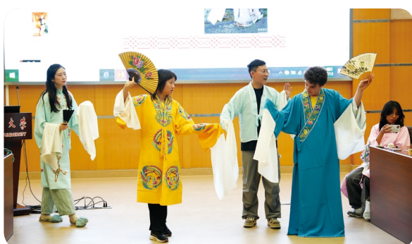
Learning Kunqu opera at Yangzhou University

At Xinhua Middle School's lacquer fan workshop, the U.S. visitors crafted galaxy-themed patterns under Chinese students' mentorship. The interactive Kunqu opera teaching at Yangzhou University was conducted amid swaying wormwood sachets in tune with Kunqu operas. In Slender West Lake, smart boats carried the teachers and students through "Twenty-Four Bridges under the Moon".