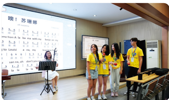
Performing American country ballads with Chinese musical instruments at Nanjing No. 9 High School

During their school visit, the American students joined their counterparts in morning exercise, guitar playing and singing, and a basketball match. They tried their hand at calligraphy and ink wash painting, and learned traditional Chinese dance. Through diverse cultural interactions, the teenagers from both countries