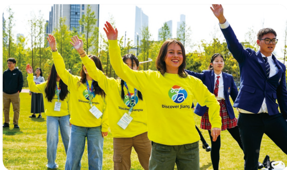
Exercising together during a break at Nanjing Jinling High School