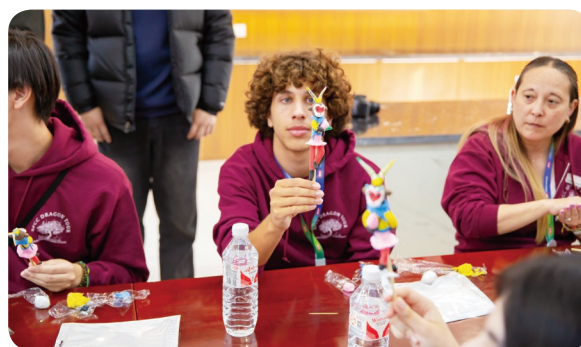
Dough sculpture-making at Lianyungang Technical College

viewed mythical scenes such as "Havoc in Heaven" through AR glasses, gaining insights into China's top mythological IP via modern technology.